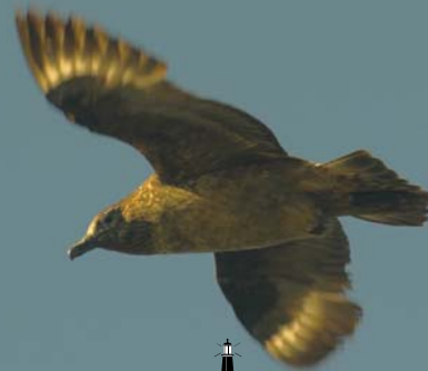
Rua Reidh Lighthouse